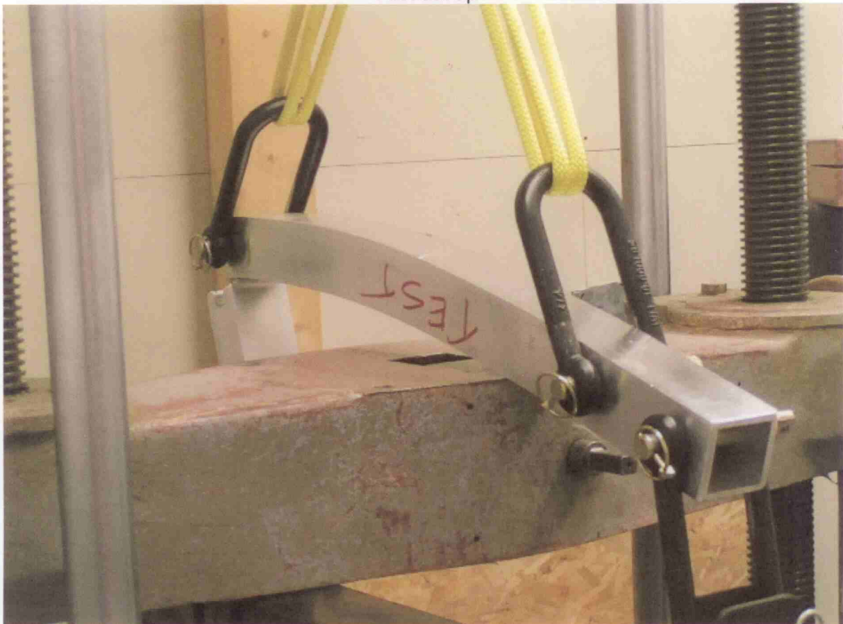
Sample at failure