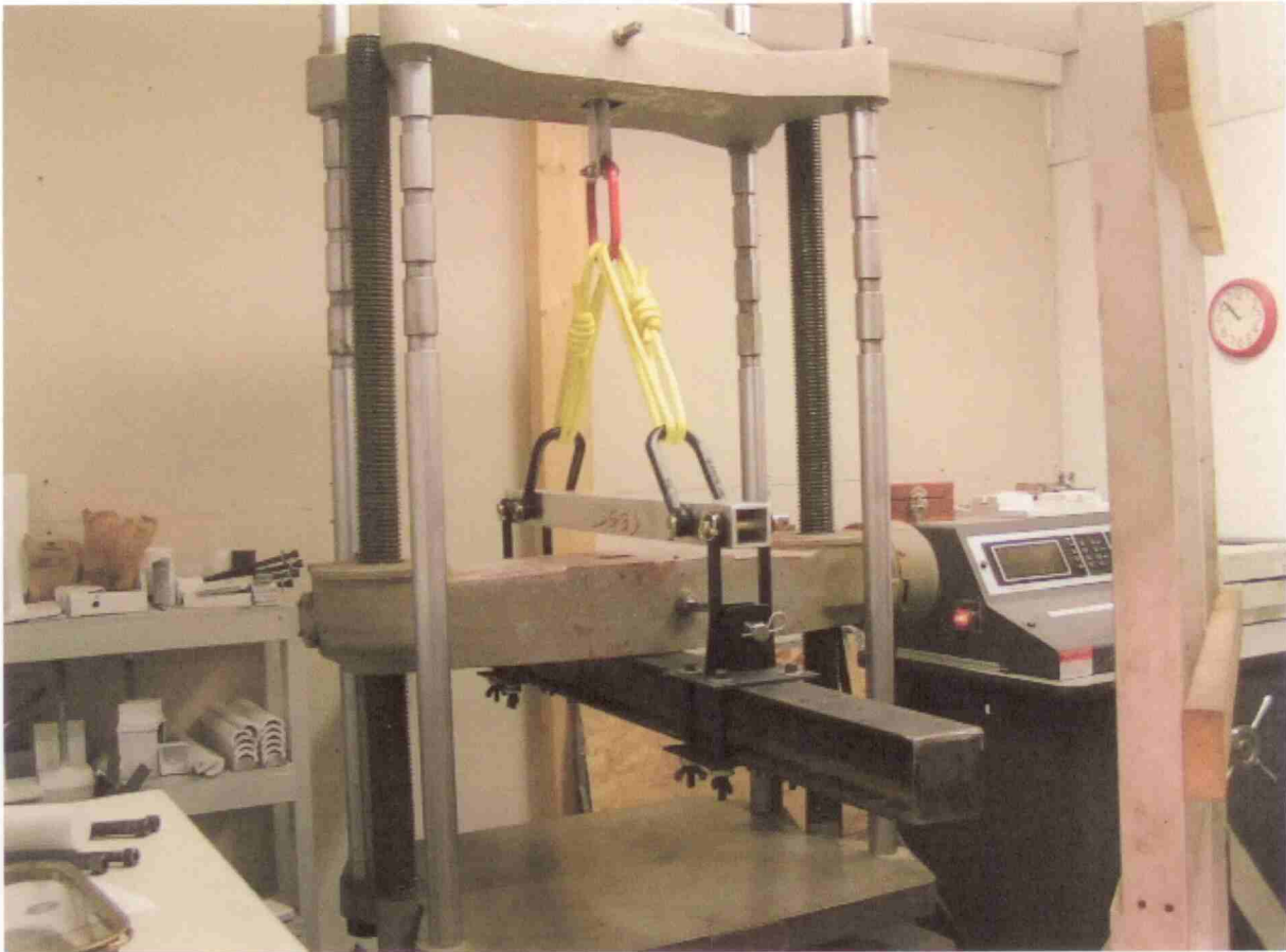
Test set up